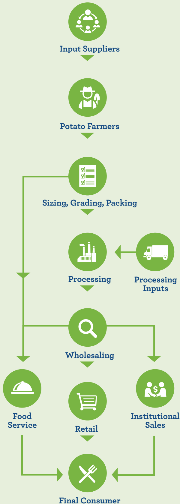
FIGURE 1: THE SUPPLY CHAIN FOR POTATOES

PepsiCo and Campbell Soup Company, through their Frito-Lay and Snyder-Lance divisions, are the largest producers of chips. Though the snack food segment exhibits slow growth, there is some growth in craft or specialty chip production. There is also product innovation in the chip sector focusing on lower sodium varieties, baked chips, and chips with a lower oil content designed to improve the healthfulness of chips (Diment 2021).